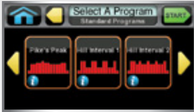
SELECT YOUR PROGRAM.