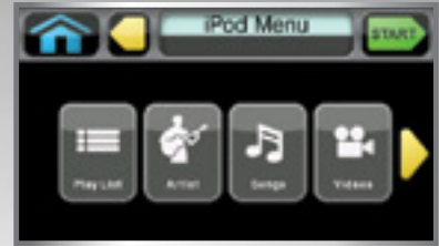
PLAY YOUR MUSIC.