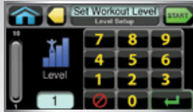
CHOOSE YOUR LEVEL.